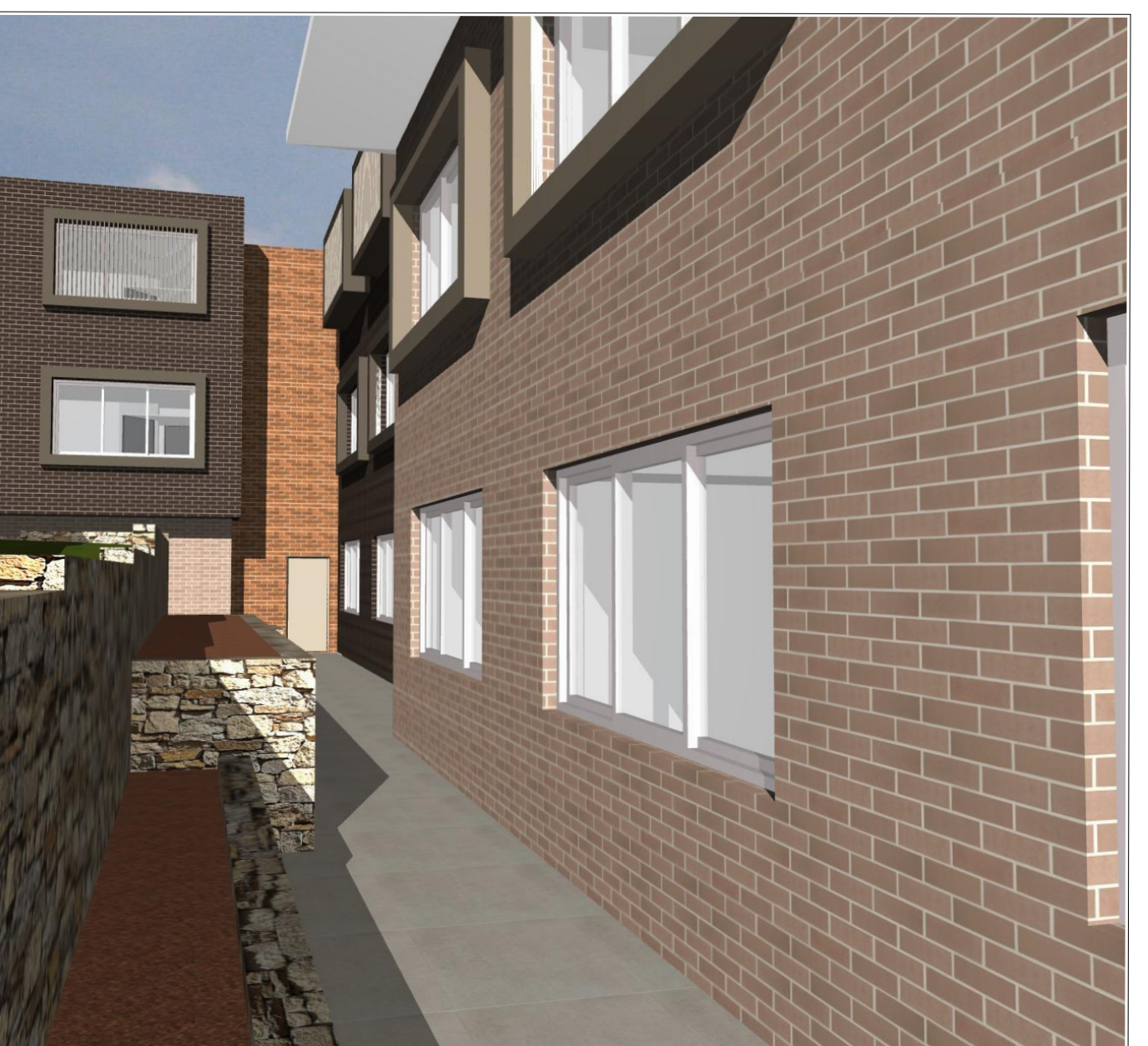
22 JUNE 10 AM - COURTYARD EAST